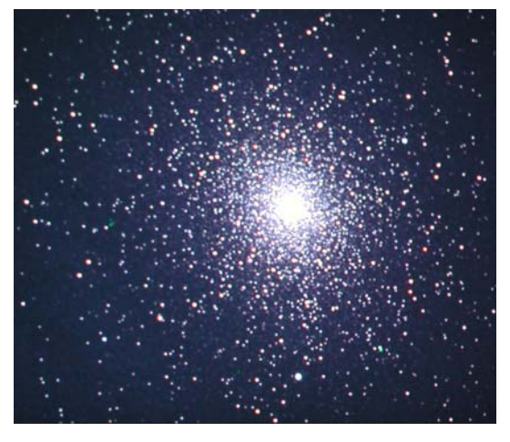
Remote capture from Starfest 2006.

47 Tucanae as imaged by David Levy's observatory.