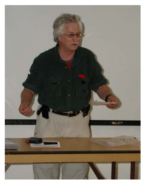
NYAA Meeting November 7<sup>th</sup>, 2006